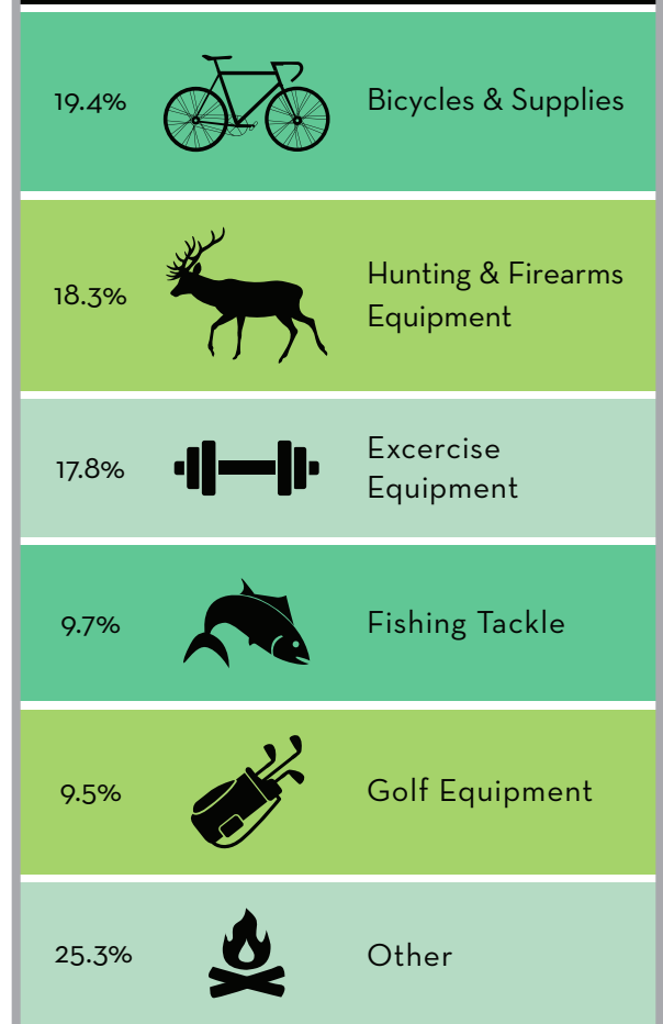
SOURCES OF SGST REVENUE

The Comptroller of Public Accounts estimates the revenue from the sales tax on sporting goods using national surveys of the sporting goods market. The Comptroller estimated the following distribution of SGST revenue for the 2012-13 biennium, which is the most recent categorized estimate available: