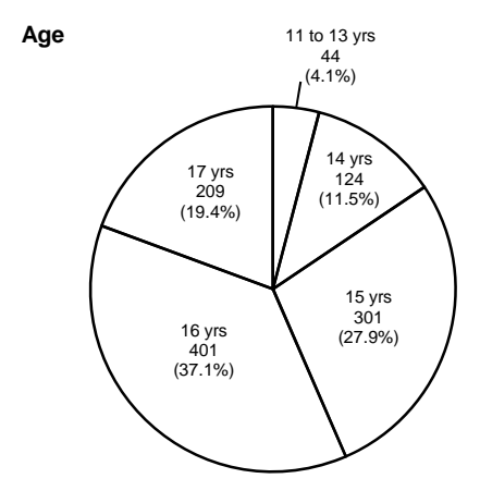
FIG. 3 AGE AND ETHNICITY OF JUVENILES IN LOCAL SECURE PLACEMENT FACILITIES AS OF AUGUST 31, 2012

Fig. 3 shows the age and ethnicity of juveniles in local secure juvenile placement facilities on August 31, 2012. A total of 65.0 percent (702) were 15 or 16 years old, while 81.3 percent (877) were either African American or Hispanic. A total of 13.4 percent (145) were female while 86.6 percent (934) were male.